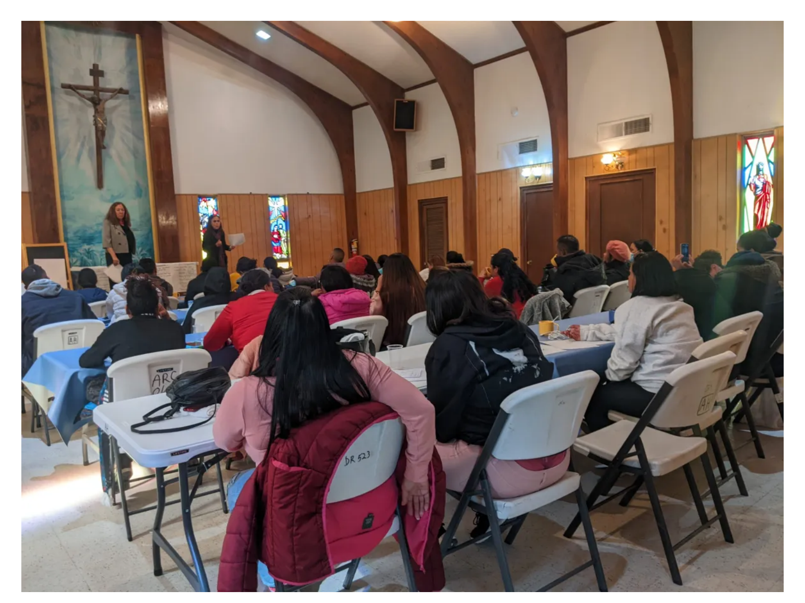
About 40 migrants attended an asylum workshop at the Casa Papa Francisco shelter on Thursday.

by Priscilla Totiyapungprasert January 20, 2023